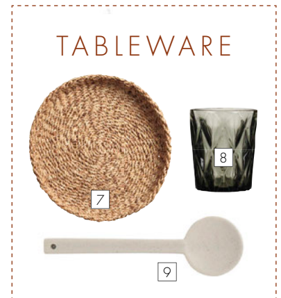
1. Madame O Lounge armchair R9 050, Roche Bobois 2. Z-side table R1 900, Incanda 3. Steamer lounger R4 995, Weylandts 4. Friday Swamp scatter R579, Loads of Living 5. Ruby Fountain paint , Dulux 6. Cuttlefish (Y3-B2-3) paint , Plascon 7. Round straw tray R299, H&M Home 8. Tinted texture whiskey glass (smokey grey) R49, @home 9. Eli Ceramic spoon R69, Country Road 10. Faux Mohair throw R425, Woolworths 11. Vase R149, H&M Home